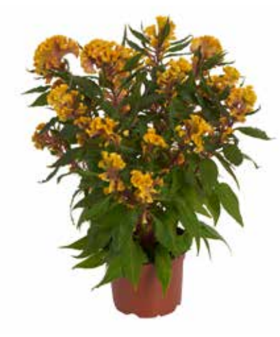
HOT TOPIC® Code 5901 GOLDEN Vigour M RT 5

HOT TOPIC® Code 5536 CLOWN Vigour M RT 6