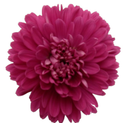
Cherry Red Regent