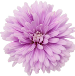
Light Blue Regent