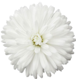
Pure White Regent