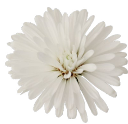
Ivory White Regent